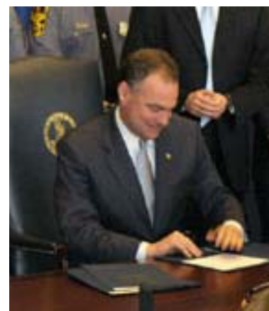
Virginia Governor Tim Kaine (Convened Virginia's Commission on Sexual Violence)

"[These frameworks can] empower the next wave of researchers and practitioners to invent effective 'big-picture' strategies for preventing sexual violence and intimate partner violence."